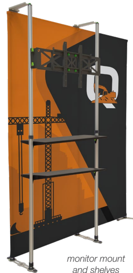
monitor mount and shelves

20" countertop and internal shelf supports up to 50 lbs.; 38" and 79" countertop and internal shelves support up to 100 lbs.