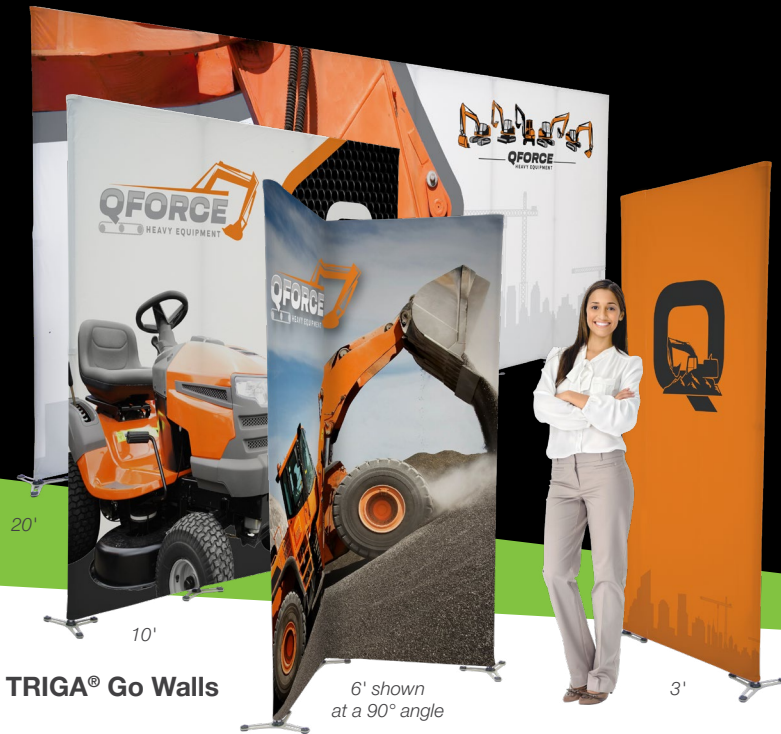
TRIGA® Go Walls